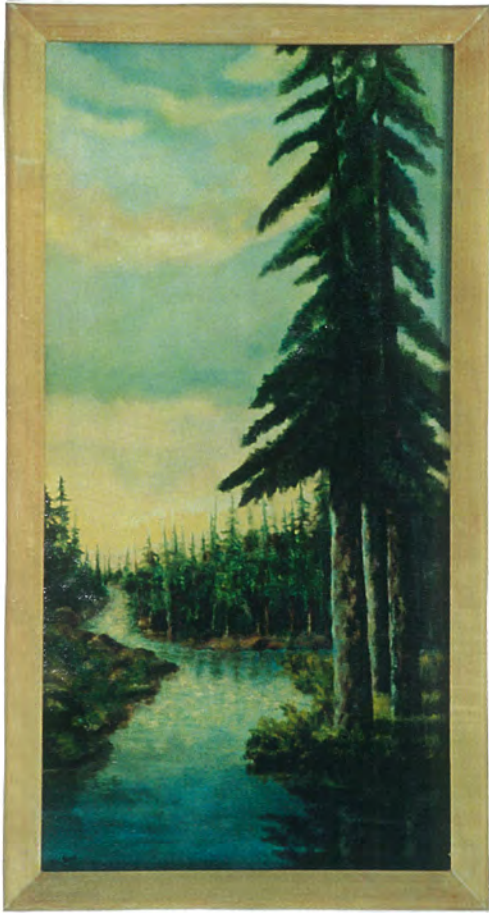
F.C. Bush 1936 (18" x 36")