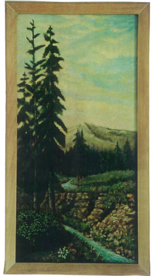
F. C. Bush 1936 (18" x 36")