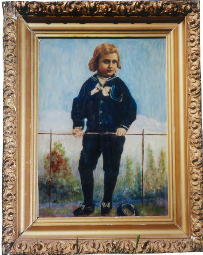
Son, S. E. H. Bush as they left England

All paintings vary in size, some small and some very large. Thus the photo size does not reflect the paintings actual size.