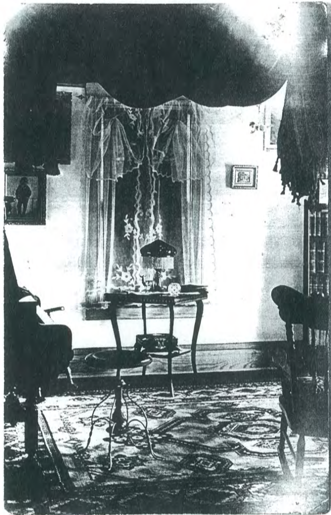
Bush's front room Address unknown