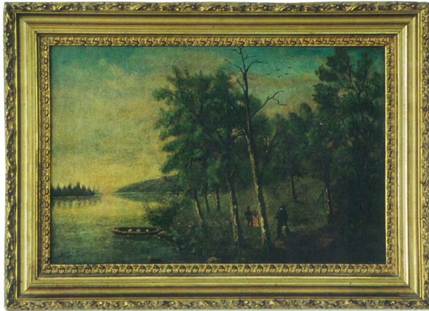
F.C. Bush 1924 (19" x 13")