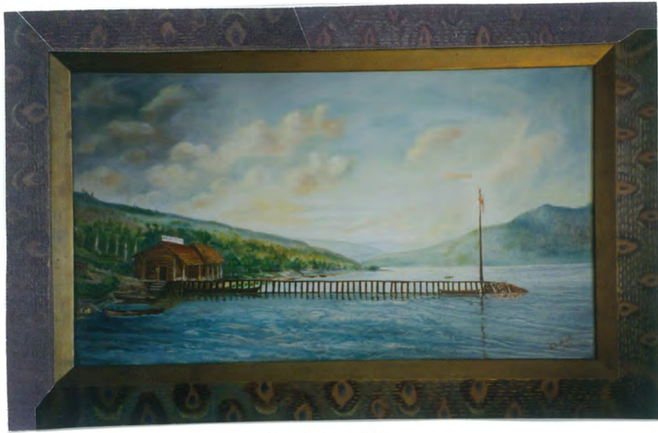
Fish Lake 1927