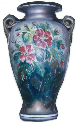
Painted on back side of wedding present vase to Florence Maud White Wallis