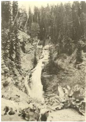
Fox Creek Falls

Wanlasses built with extraordinary effort to bring irrigation water from far up Fox Creek. A sturdy barn was also built, a granary and other outbuildings. Apple, plum and cottonwood trees were planted near the house. Machinery was bought, used, worn out and abandoned in various places on the property, in the usual agricultural fashion. (TetonValley News)