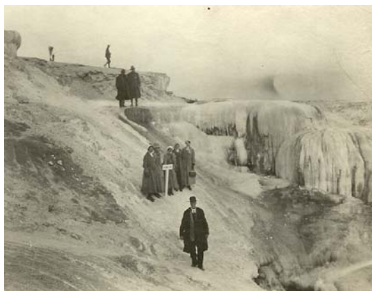
Terrace at Mammouth - Angel Falls Yellowstone Park.