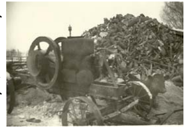
1913-1949 Wood Pile and gas engine.