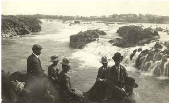
Before Idaho Falls Temple built and dedicated 1940-1945