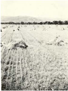
Crops on home place before Combine.