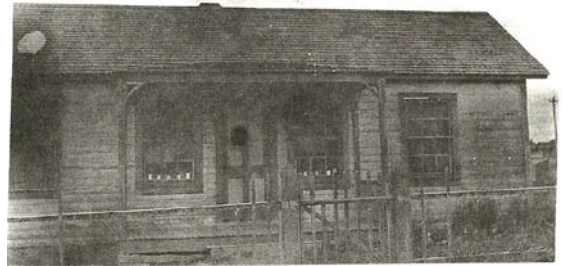
Diamondville Boarding House