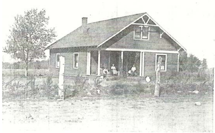
The Wanlass home on the banks of Fox Creek. Family seated upon front porch. The home was painted a red brown and trim was white. When home purchased it was only a two room log house. Many trees were later planted about.

1913 Spring The family worked together and soon had things going. Margaret worked in a store in Victor, Idaho and rode a horse back and forth when she could. If she couldn't she boarded in and sent money to her parents to help keep things going and get the ranch producing food. In due time they built on a living room, two bedrooms on the main floor and enlarged the upstairs bedroom. Their house was one of the nicer houses in the Chapin community in Teton Valley.