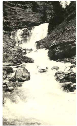
Fox Creek Falls, July 1, 1922