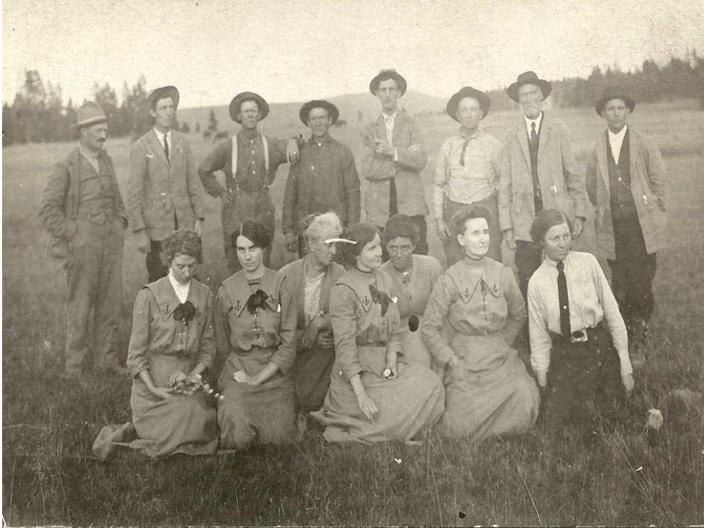
Relatives going thru the Park - Yellowstone